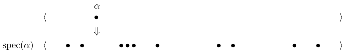
Figure A. Each real number \alpha determines \text{spec}(\alpha) , a countably infinite subset of the reals.