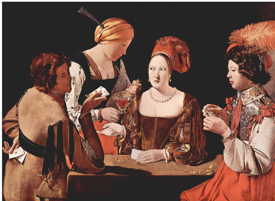
Figure 2. Georges de la Tour's circa 1635 painting "Le Tricheur" (or "The Cheat"). The painting currently exists in two versions. This version (also known as "The Ace of Diamonds") is in the Louvre. The online version of this figure is in color.

was a hope for a Robust New World on a scale that would displace most of classical statistics, now there was no audible voicing of such a hope. The euphoria of the first decade proved to be unsustainable. Reasons for this change were not hard to find. Indeed, some were noted in the discussion of Bickel (1976), and many of them were summarized in a new chapter Peter Huber himself added to the 1996 second edition of his 1977 SIAM monograph. As models grew more complicated, so too did the question of just what "robust" meant. The potential model failures in a multivariate time series model are huge, with no consensus upon where to start. Even in such cases, important progress was made, but with lower expectations of completeness. The crisp formulation and brilliant solutions for the location parameter problem were not to be repeated. The Neyman–Pearson Lemma extends effortlessly to Banach and Hilbert spaces; Huber's (1964) result was not available for the more complex worlds that modern statisticians live in.